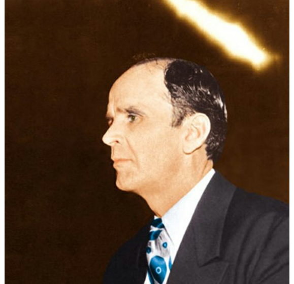
William Marrion Branham